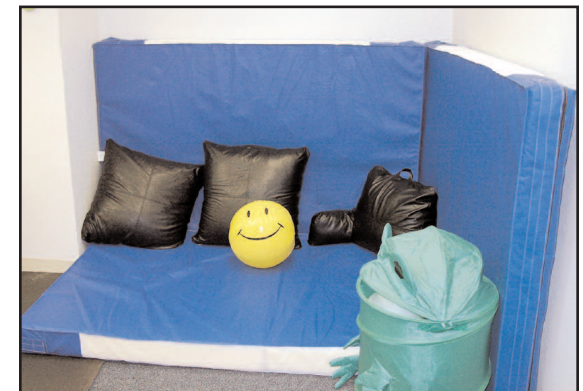
Sensory Integration Room

Offered by CLASP Homes, Inc. with the generous support of the Greater Bridgeport Area Foundation and the First County Bank Foundation.